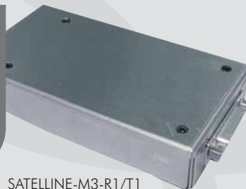
SATELLINE-M3-R1/T1 with aluminium housing